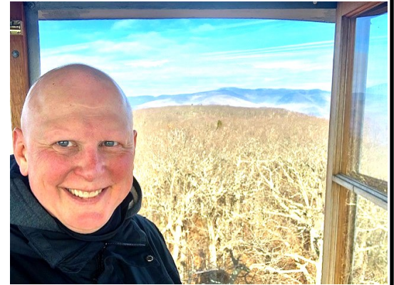
Hiking at Mt. Tremper November 2022

After graduation, he began a career in injury claims for an insurance company. He worked in various positions in the insurance industry for twenty-four years. When he was laid off by the first insurance company shortly after purchasing