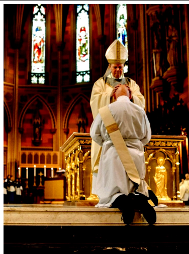
Laying on of Hands by the Bishop at his Priestly Ordination